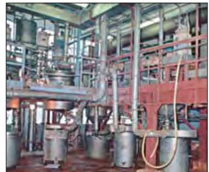
The company established a new gold refinery in 1996.