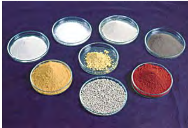
The company manufactures an extensive range of precious metal powders.