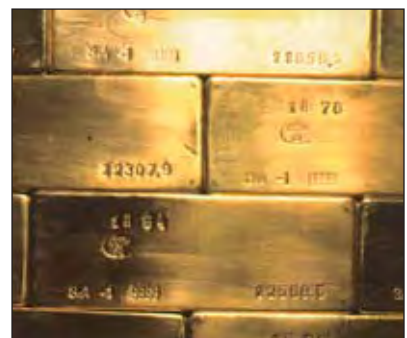
The Shelkovsky refinery has been accredited to the LBMA under its own name since 1999.