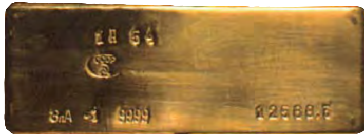
Historical 400 oz bar.

The company marked 400 oz bars with the USSR "СССР") official stamp until 1997.