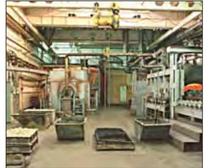
The Shelkovsky Plant traces its origins back to 1941 during the Great Patriotic War.

The company also refines silver, manufacturing a range of silver bars.