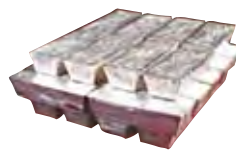
London Good Delivery 28-32 kg silver bars manufactured by the Shelkovsky Plant.

This supplement is supported by The Gokhran of Russia